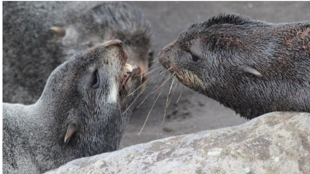
Northern fur seals on the Pribilof Islands